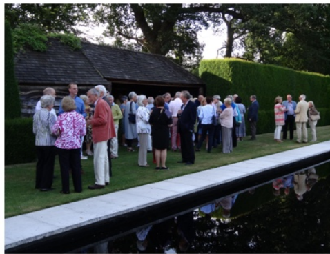
Friends and Volunteers at the 2017 GRDM Summer Party at Kiftsgate