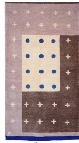
GR Trust Collection