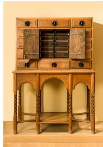
'Paris' cabinet